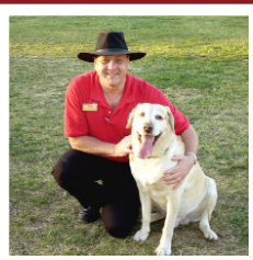
Max... Loves to "Frisbee"